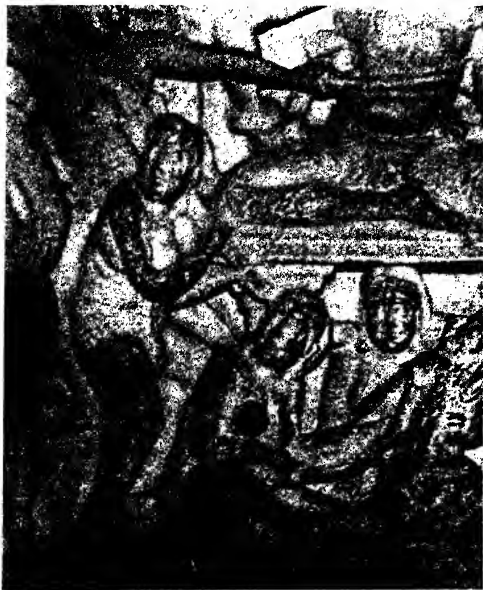
Harp from Amaravati (2nd cent. A. D.) The figure at the bottom holds the harp in the playing posture. (See page 212)