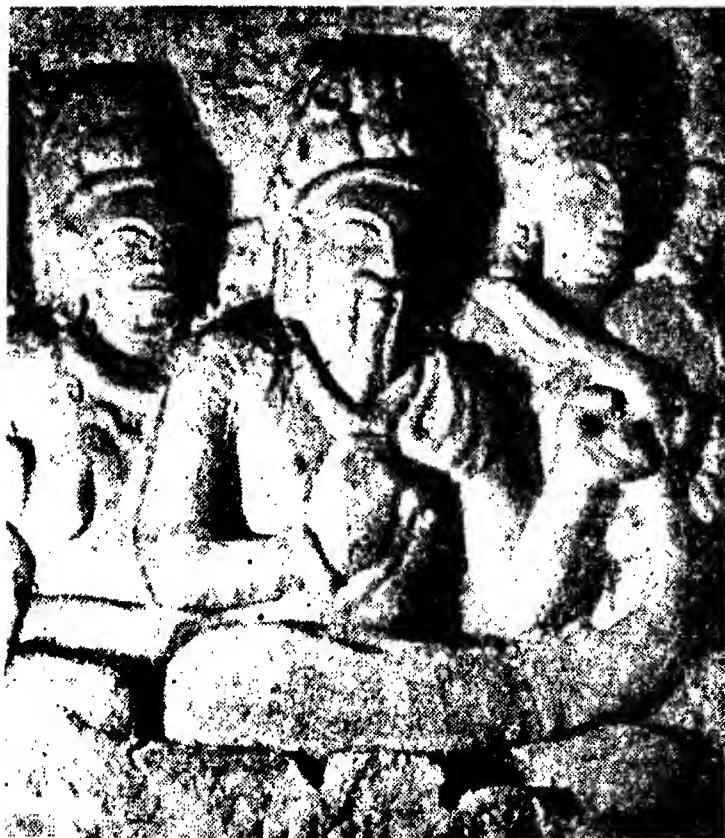
Sculpture of the Yazh in the temple at Tirumayam (8th Cent. A.D.) (See P. 20)