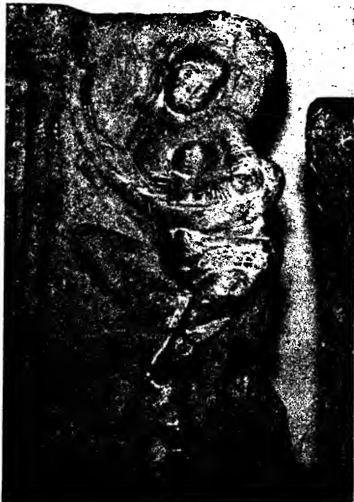
Harp from Goli - Guntur Dt. (c. 250 A.D.)

The strings can be clearly seen in the picture. (See Page 212)