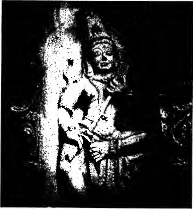
Vinadhara Dakshinamurti from the Kailasanathaswami temple (10th cent. A.D.)

The Vina is held in the normal position from left to right and played. This is a nissāri vina i.e. without sāri or frets i.e. with a plain finger-board. It was played like the Sarode. (The posture in which the modern Sitar is held and played is the same as the one depicted above)