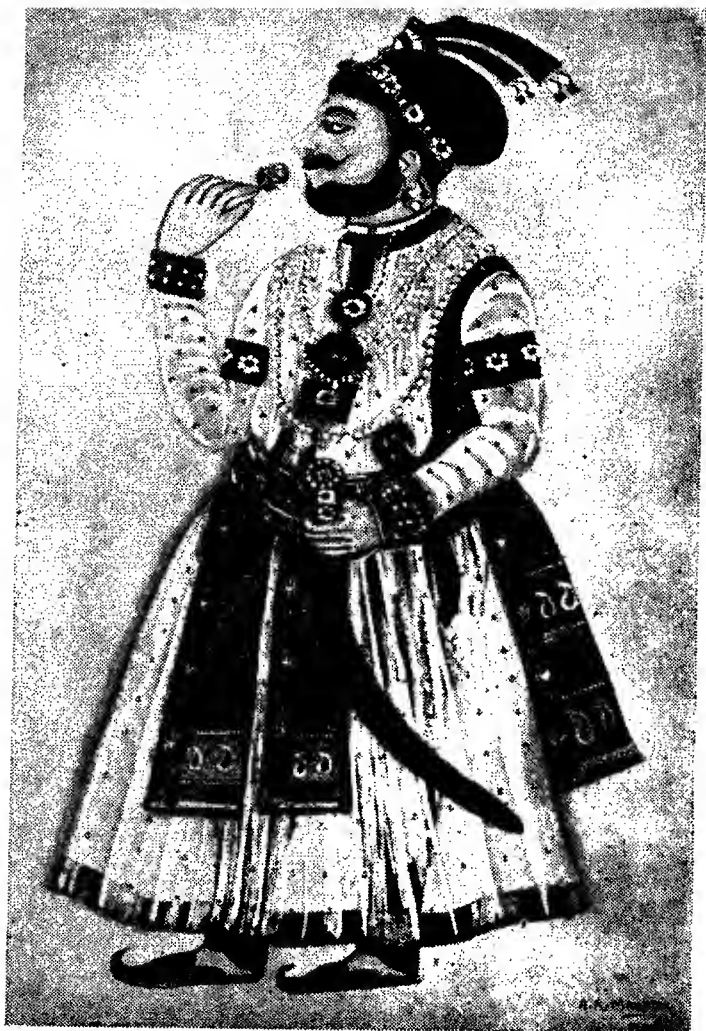
Shahaji Maharajah of Tanjore (1684—1710 A.D.) Royal patron and Composer and the author of the Telugu Opera; Pallaki Seva Prabandham .—See P. 245