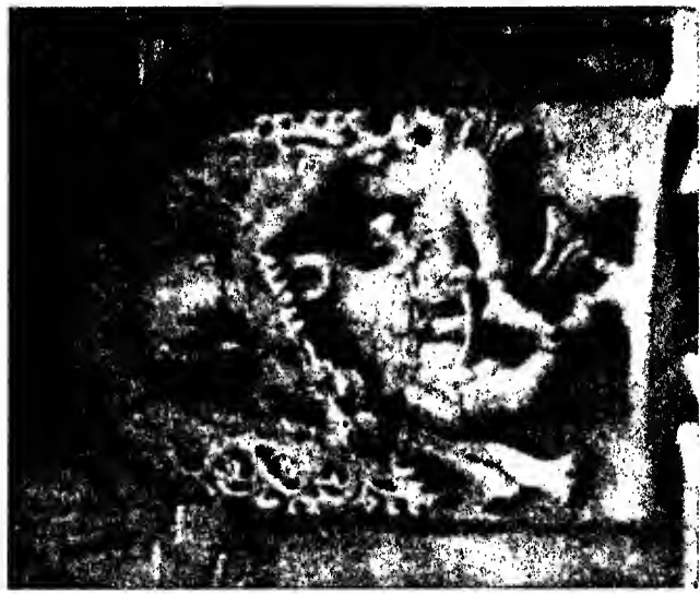
Vinas with frets for a part of the finger-board. Belur Sculptures (Mysore) (See page 214)