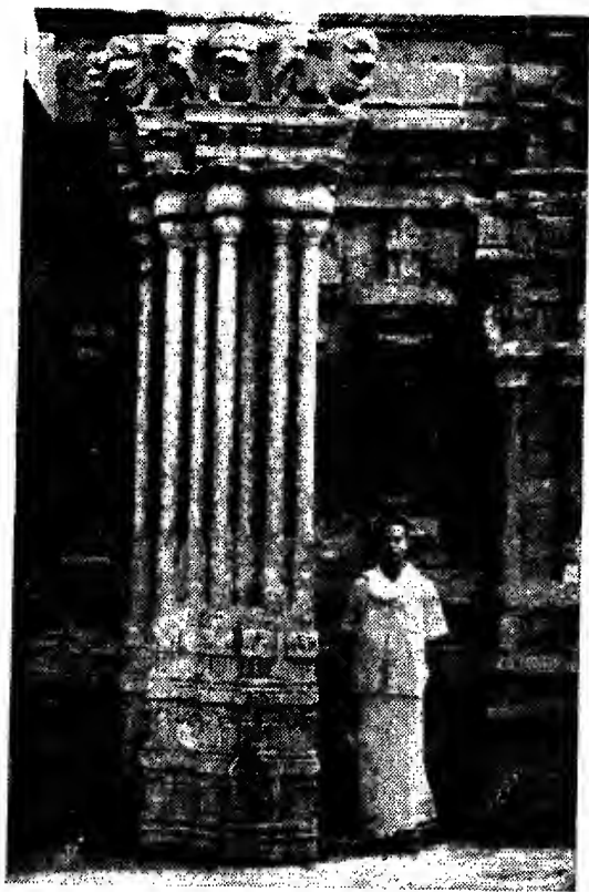
Musical Stone Pillars