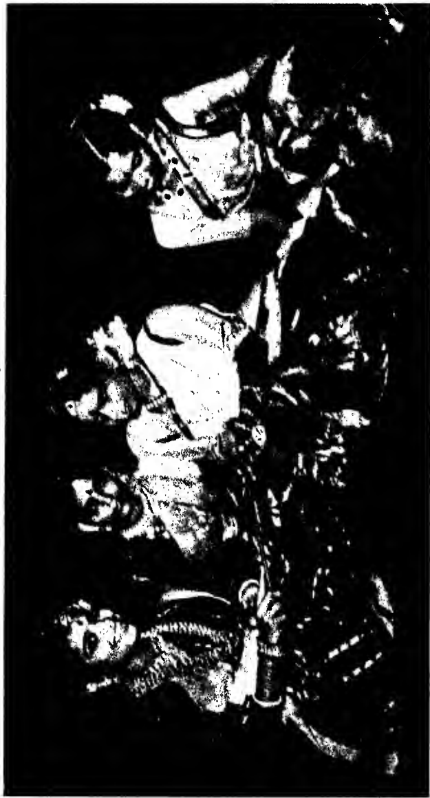
A scene from the Viralimalai Kuravanji (Tamil dance drama) The Kuratti (gypsy woman) is reading the palm of the hand of the heroine, Raja Mohini (See p. 93).