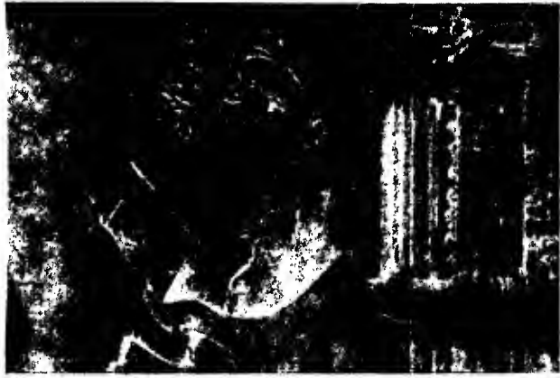
Kinnari — Celestial musician (female) Half-human and half-bird