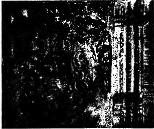
Kinnara — Celestial musician (male) Half-human and half-bird

In the above illustrations, stringed instruments with a gourd on the top can be seen (See Page 206).