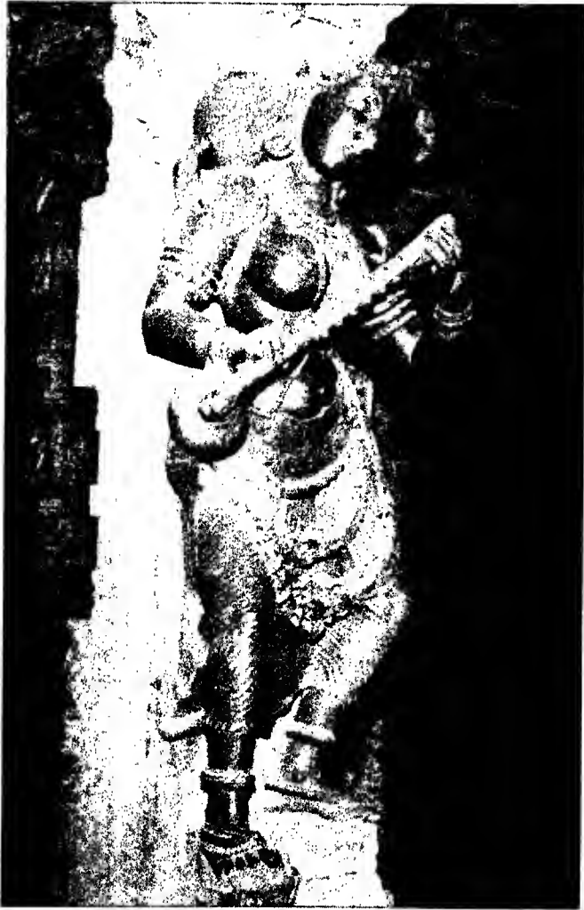
Vina in the 1000 pillared Mantapam in Madura temple with frets for a part of the finger-board. (See P. 214)