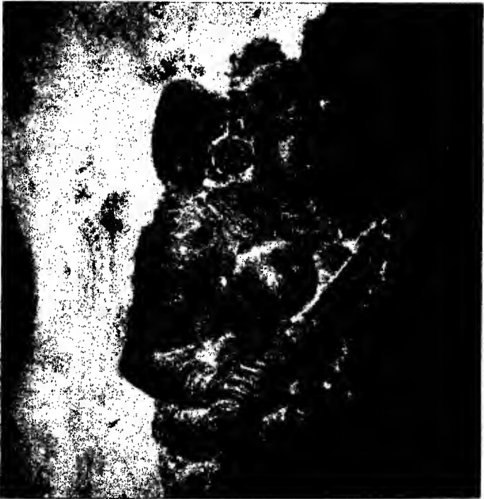
The fretted vina depicted in the temple at Pattisvaram (See pages 39, 40 and 139) (The Instrument is slightly broken at the top part)